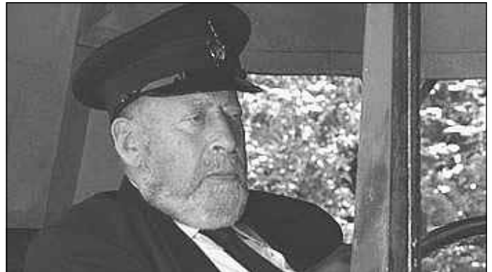
Sir Clement is bewilderingly Her Ladyship's chauffeur!