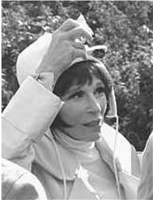
Fenella Fielding stars as Her Ladyship