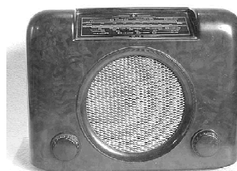
The wonders of wireless - Above: Maurice Rubens' table-top model of his set for DICK BARTON - SPECIAL AGENT. Left: External view of a 1950s Bush Radio ... with knobs on.